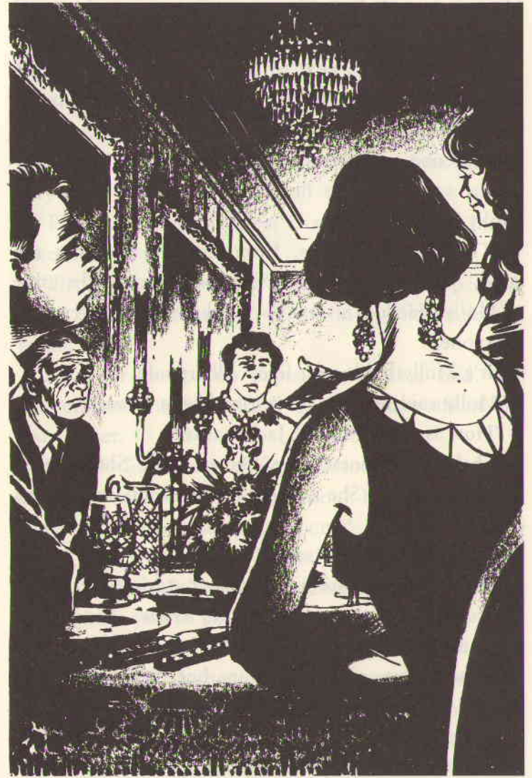
‘The table looks nice, Jackie. What wonderful flowers!’ Diane said.

‘The table looks nice, Jackie. What wonderful flowers!’ Diane said. She was a beautiful girl, with long