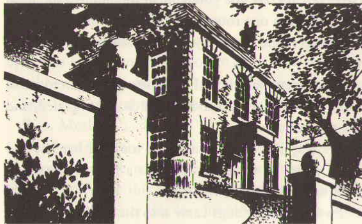
The Clarkson family had a big, old house with a beautiful garden.