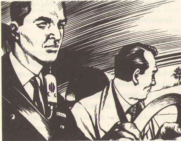
The two detectives drove to the Clarksons' house.

At three o'clock the two detectives drove to the Clarksons' house.