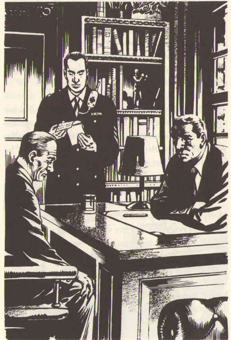
'Sergeant Foster is going to write it all down.'

'Tell me about last night,' Inspector Walsh asked quietly. 'You were angry with Mrs Clarkson.'