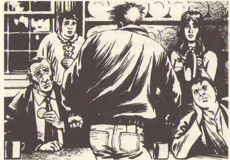
'Peter Hobbs was very angry about a letter.'

'Good. Tom Briggs came into the kitchen, too. Are you going to talk to him?'