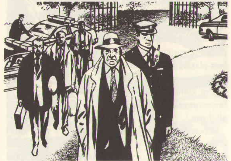
A lot of police arrived very quickly.