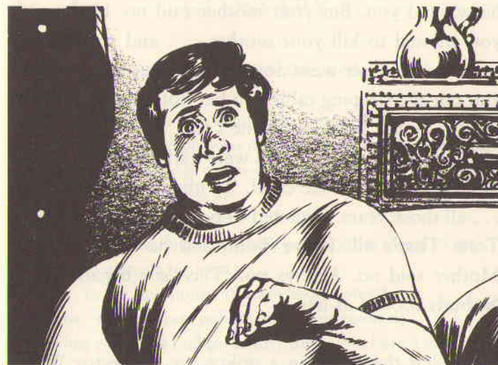
Jackie asked, 'What about Diane? You found the empty bottle in her bag.'

'No. We found the empty bottle in Diane's room .